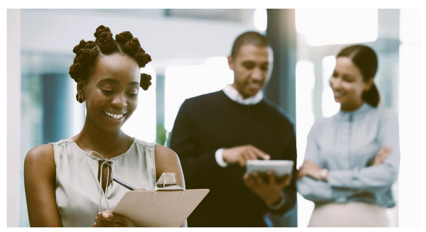
Trainees engaging with Netlibrary's Modern Workforce Strategies, bridging learning with practical application.

Netlibrary Consulting is at the forefront of providing specialized training solutions designed for the unique challenges and opportunities within government agencies. Our commitment to excellence, innovation, and tangible outcomes drives us to empower public sector professionals and organizations to excel amidst challenges, seize opportunities, and achieve developmental milestones through continuous learning. Our training methodology is deeply rooted in a blend of industry insights and adult learning principles, ensuring that each session is not only informative but engaging and directly applicable to the public sector environment.